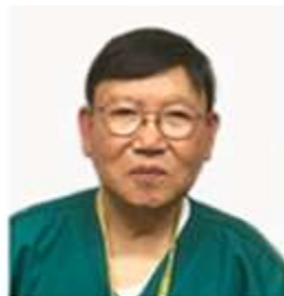
Park, Bvuna Ho