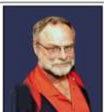
Gene Idol Taijutsu Sensei Battle of Columbus REFEREE - 2011 Taijutsu 10 th National - Dayton, OH